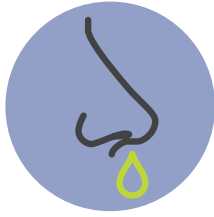
Runny or stuffy nose