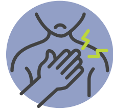
Mild to moderate chest discomfort