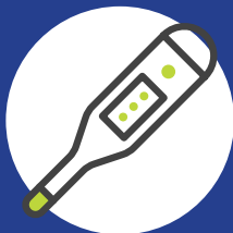
Fever or chills